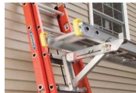
2-Rung Bracket Jack

This style of jack hooks directly onto two or three ladder rungs. With these types of ladder jacks, planking may be placed on top of the bracket jacks to create a working platform.