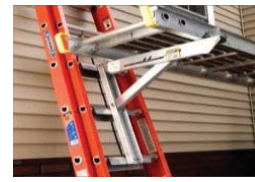
3-Rung Bracket Jack